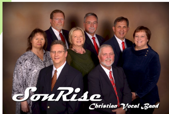
SonRise performing April 28th at Red Ridge UMC, 4:00 PM.