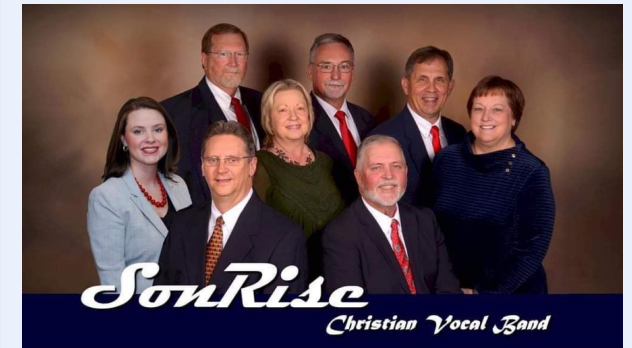
SonRise Christian Vocal Band

Sunday Night January 28th @5pm PLEASANT HILL BAPTIST CHURCH